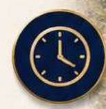
DEPARTURE 4-5 PM