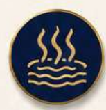
HOT WATER SPRINGS